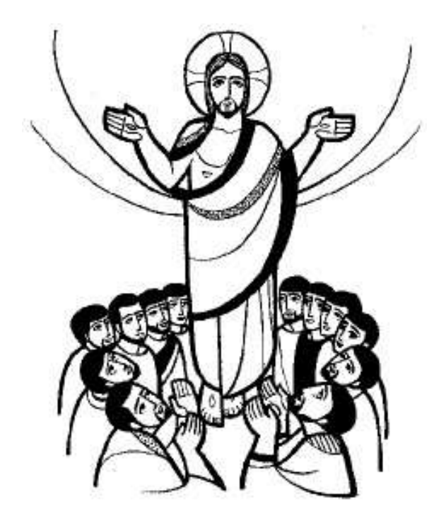
The Ascension of the Lord

'Now as he (Jesus) blessed them, he withdrew from them and was carried up to heaven. They worshipped him and then went back to Jerusalem full of joy.' The feast of the Ascension of the Lord is above all else a feast of hope. Hope has been described as, not just some vague kind of feeling, but rather having someone or something worth living for and dying for. In Christ we have such a person. He lives in us in our marriage and family relationships and it is worth putting every effort into making those the best possible for his sake. He lives among us in our community and again we need to do everything in our power to make our parish the best we possibly can to his glory and for the good of all. And Christ lives for us in heaven at the right hand of the Father, assuring us of our ultimate destiny among the saints. We can aim to be there!